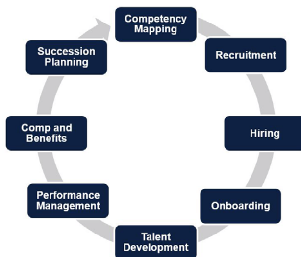
Fig.1. Talent Information Integration Management Network Structure System

With the increasing enrollment of higher education institutions, the innovation ability and scientific research quality of college students have been criticized and questioned. The transformation and development of local colleges and universities must be supported by high-quality disciplines and universities. Strive to become a base for talent cultivation and technological innovation to support the upgrading of local industries. Knowledge and technological innovation, as the two main driving factors, need to cultivate financial management talents with good scientific and cultural literacy, solid professional knowledge, and strong self-learning ability and innovative ability to develop. Figure 1 shows the network structure system of talent information fusion management.